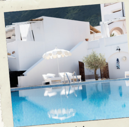
Hotel Principe di Salina

Price includes all accommodation, private minivan transport, entry fees and most meals. Flights not included.