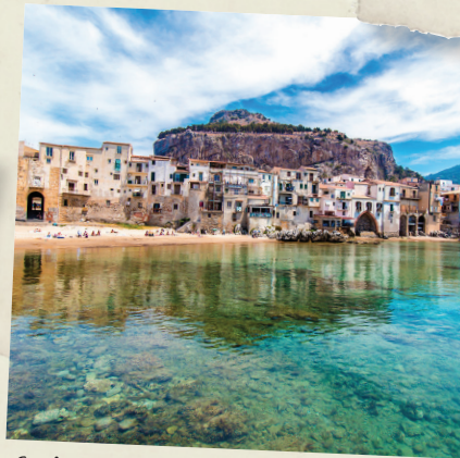
Cefalù's Old Town