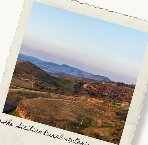
The Sicilian Rural Interior

A deeper experience of Italy In giro Tour of Sicily 2022