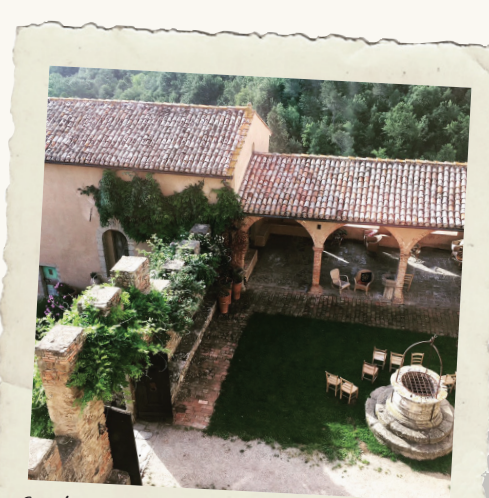
Castello di Potentino